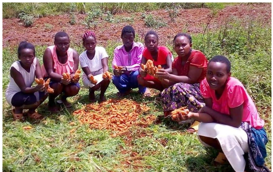
A member of Joy Tuuru with their corn harvest and members of Imani Kirindine with their April 2020 harvest of carrots