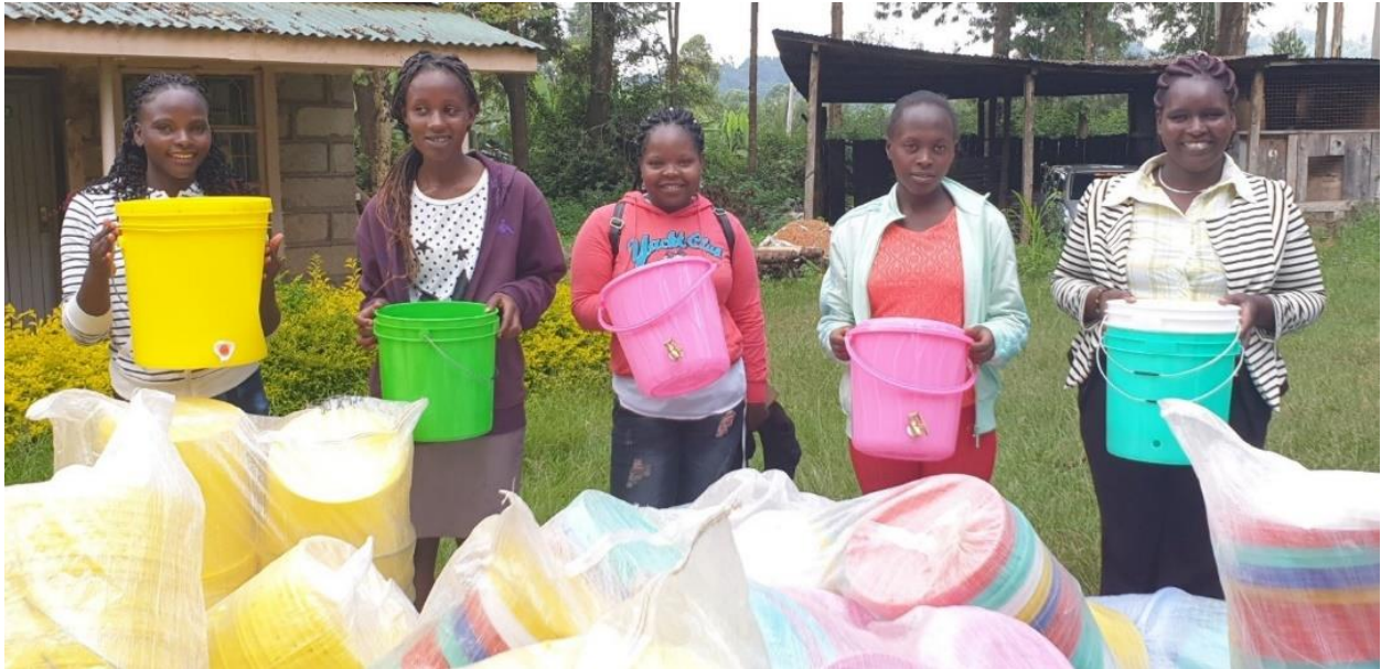
Zoe girls with the handwash containers they received from Zoe to facilitate handwashing at household level.