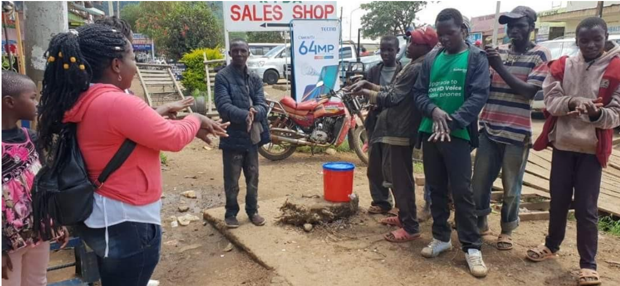
Street children in Maua learn about COVID-19 prevention and handwashing from a Zoe participant

The global outbreak of COVID-19 has affected many countries, including Kenya. Lives have been lost and businesses affected. To cushion Zoe Empowers participants from the pandemic, program staff in Kenya trained empowerment group members on hand washing basics and provided hand washing containers, sanitizers, and soap. Equipped with this knowledge and resources, these program youth have taken on the role of spearheading mitigation efforts in their communities by teaching community members the importance of hand washing, social distancing, wearing masks, and avoiding crowded places. They made a special effort to reach out to the elderly and street children who have been greatly affected by the pandemic.