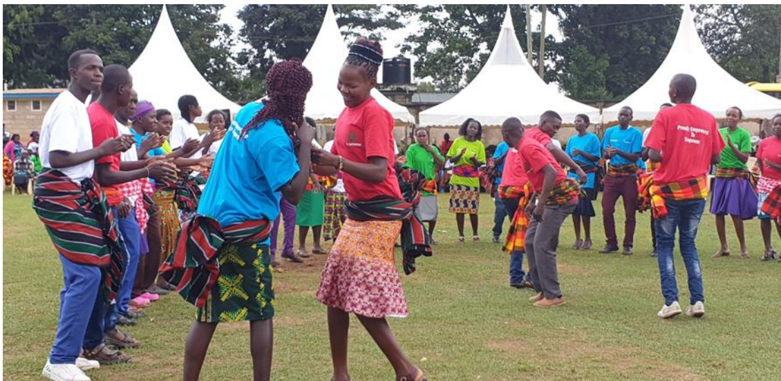
Zoe participants from Tharaka Nithi County entertain during the 2017-class 1 graduation ceremony in January 2020

In January 2020, Zoe Empowers Kenya held a graduation ceremony for 15 empowerment groups that had graduated in December 2019. The event held in Maua was graced by different government leaders among them the Chief Officer for Youth and Gender from the Meru County Government who commended Zoe for the good work they are doing.